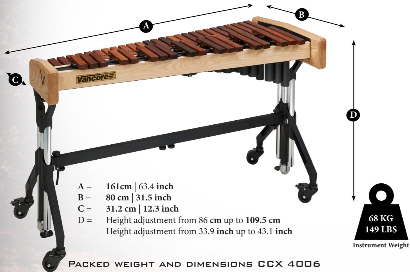
PACKED WEIGHT AND DIMENSIONS CCX 4006