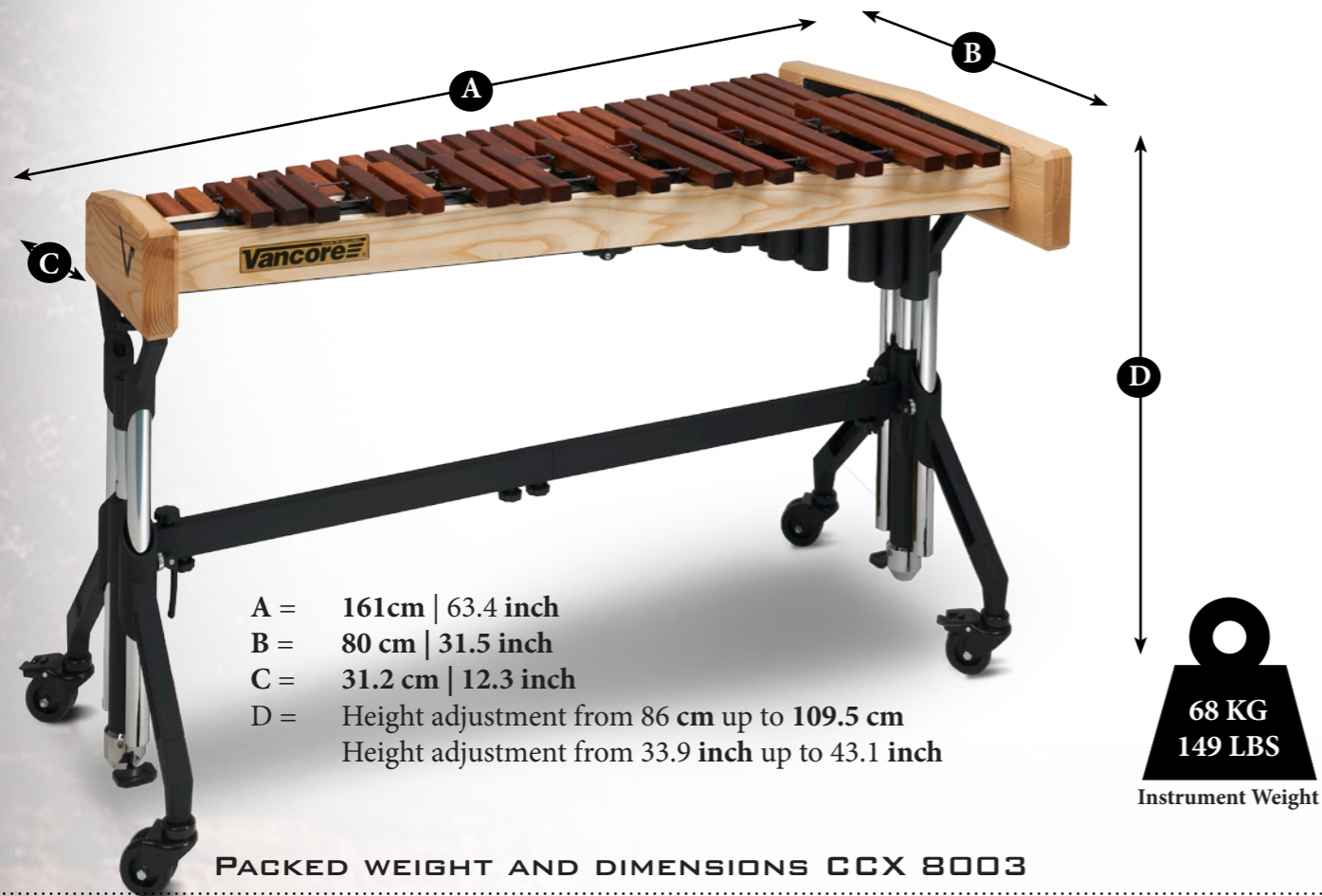
PACKED WEIGHT AND DIMENSIONS CCX 8003