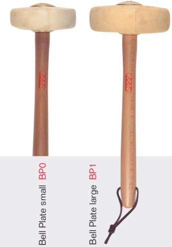
Bell Plate small BP0 Bell Plate large BP1