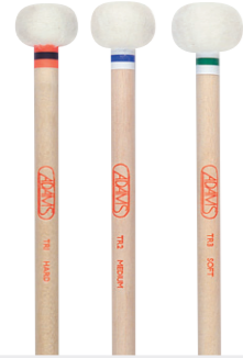
Timpani Birch hard TR1 Timpani Birch medium TR2 Timpani Birch soft TR3