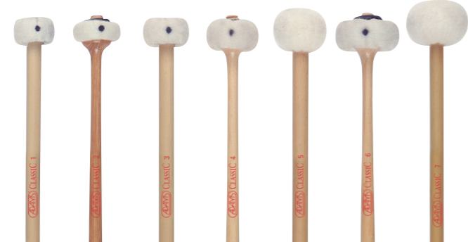
Bamboo cartwheel CD1 Very bright and brilliant Hickory cartwheel CD2 Bright Bamboo cartwheel CD3 Warm, Sonorous Hickory cartwheel CD4 Legato Bamboo ballstick CD5 Dark, Mellow Hickory cartwheel CD6 Soft, rich Bamboo ballstick CD7 Dark, Sonorous, Rich Hickory wood stick CD8 Extremely hard, Bright Hickory Flip stick CD9 Extremely bright to general Hickory Chamois stick CD10 Very brilliant to articulate