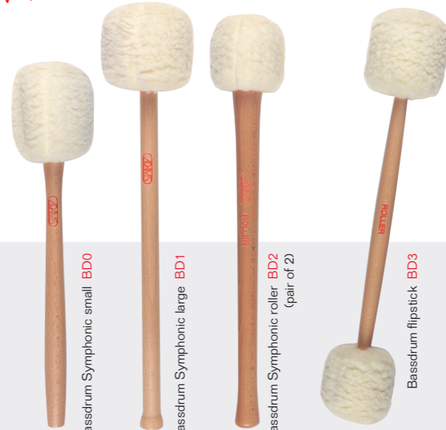
Bassdrum Symphonic small BD0 Bassdrum Symphonic large BD1 Bassdrum Symphonic roller BD2 (pair of 2) Bassdrum flipstick BD3