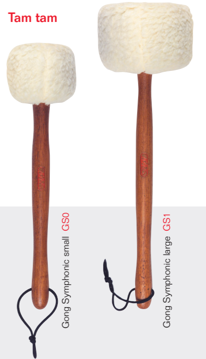
Gong Symphonic small GS0 Gong Symphonic large GS1