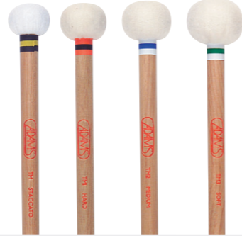
Timpani maple staccato TM0 Timpani maple hard TM1 Timpani maple medium TM2 Timpani maple soft TM3