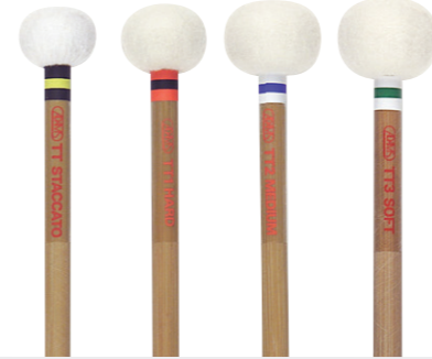
Timpani tonkin staccato TT0 Timpani tonkin hard TT1 Timpani tonkin medium TT2 Timpani tonkin soft TT3